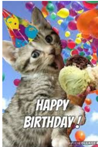
Cat Memes - Happy Birthday Cat Memes - Funny Cat Memes & Pictures